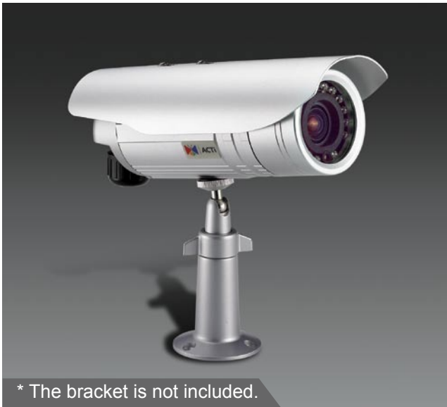
* The bracket is not included.