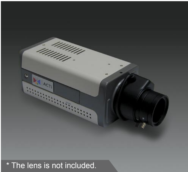
* The lens is not included.