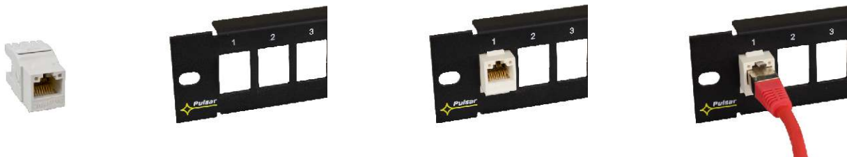
Keystone RJ45 connector